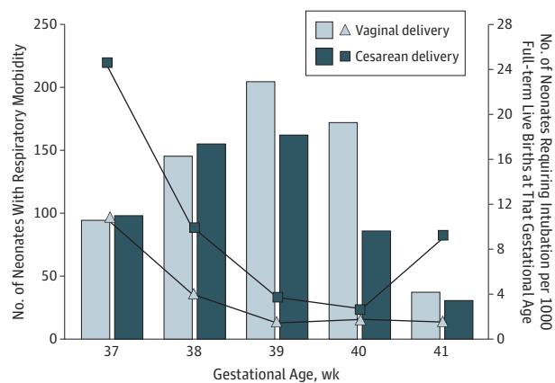
Figure 3. Respiratory Morbidity and the Need for Intubation

Bars denote the absolute number of neonates having respiratory morbidity for each mode of delivery and at each gestational age. Lines denote the number of neonates requiring intubation per 1000 full-term live births by mode of delivery at each gestational age.